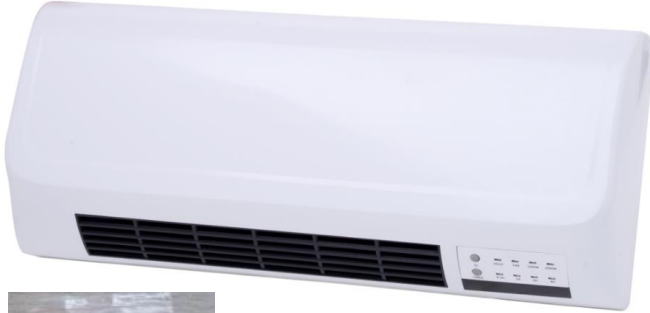
Main Unit x 1