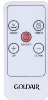
Remote x 1